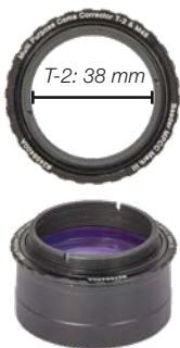
MPCC base element with mounted Stop-Ring: 38 mm clear aperture with T-2-thread

Of course, if you don't need the full aperture, you can still attach the MPCC directly at the Baader Protective Ring (with or without filter) with the T-2-thread, without any spacer rings.