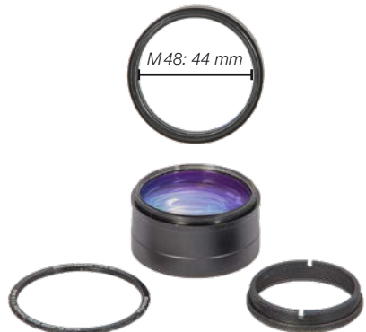
MPCC base element without Stop-Ring and T-2-Adapter: 44 mm clear aperture with M48-thread