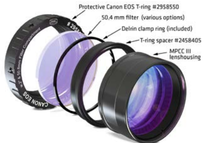
The M48 Spacer Ring #2458405 provides a larger free aperture by removing the T-2-thread (cf. image on page 2)

You can also permanently mount 50.4 mm filters inside of the Protective DSLR T-Ring.