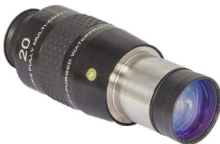
The field stop of the Explore Scientific 20 mm 100°-Okular is deep inside of the housing. The MPCC can be attached directly with the M48-thread.