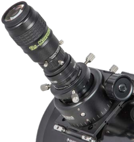
MPCC with stopping collar