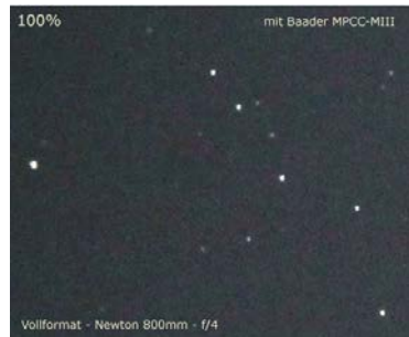
Picture detail at the edge to full frame format with and without Baader MPCC