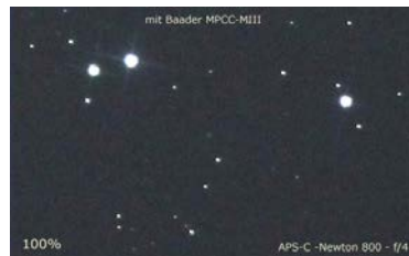
Picture detail at the edge to APS-C format with and without Baader MPCC