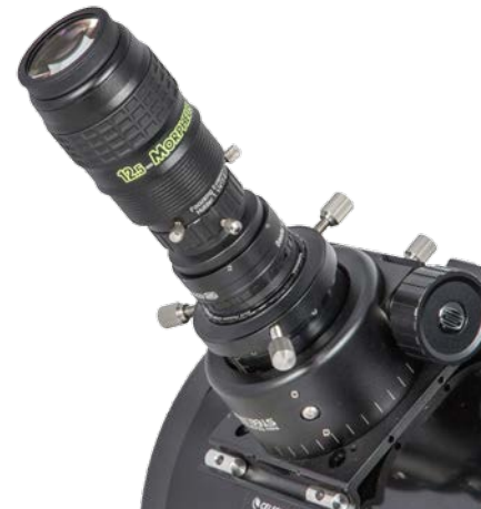
MPCC with stopping collar