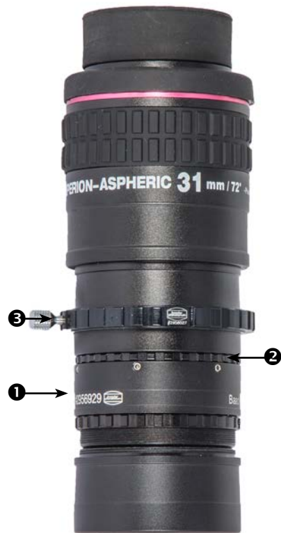
Hyperion Aspheric-eyepiece, with VariLock ①, M48 expanding ring ② and optional locking ring ③

For other eyepieces you may have to check the documentation of the manufacturer to find out about the position of the field stop. Its position may vary even inside of an series of eyepieces. Furthermore, the length of nosepieces is not standardized. With the Explore Scientific 20 mm 100° eyepiece e.g., you can screw the MPCC directly into the filterthread and do not need the M48 expanding ring.