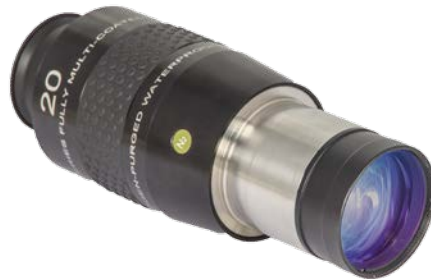
The field stop of the Explore Scientific 20 mm 100°-Okular is deep inside of the housing. The MPCC can be attached directly with the M48-thread.