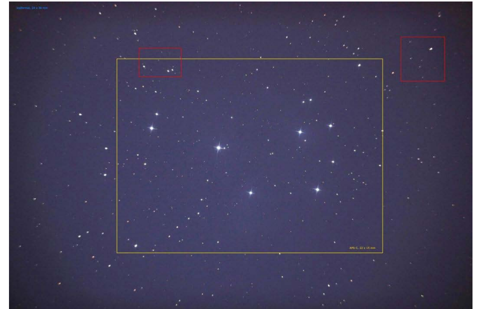
30-seconds single frame shot taken without MPCC.

The image on the next page shows a single frame shot (30 seconds), taken without the MPCC Mark III. Marked are the APS-C-format (yellow) and two selected regions of interest (red). The both red regions are magnified in the images below, each with and without the MPCC.