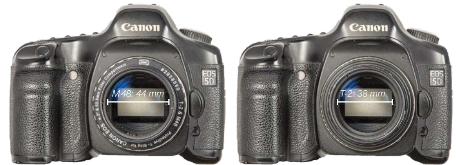
The M48-thread provides a free aperture of 44 mm diameter, which is sufficient even for full-frame DSLRs. The free aperture of 38 mm provided by the common T-2-thread is sufficient for APS-C-cameras.