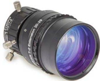
MPCC V-1-Set #2458403

With T-2 and M48 thread or photography with all Newtonian telescopes