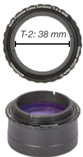
MPCC base element with mounted Stop-Ring: 38 mm clear aperture with T-2-thread

Of course, if you don't need the full aperture, you can still attach the MPCC directly at the Baader Protective Ring (with or without filter) with the T-2-thread, without any spacer rings.