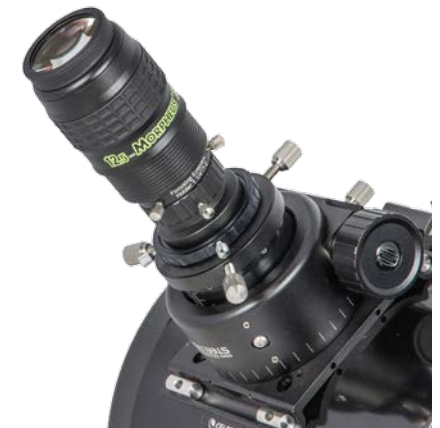
MPCC with optional finetuning stopping