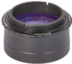
MPCC base element #2458400A

The only coma-corrector for Newtonian telescopes which does not increase the focal length. An f/4 Newton stays an f/4 Newton!