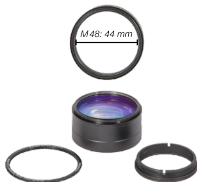
MPCC base element without Stop-Ring and T-2-Adapter: 44 mm clear aperture with M48-thread