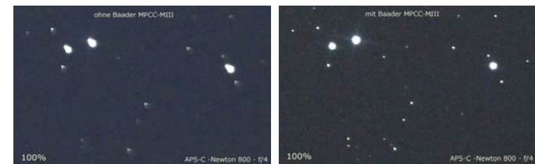
Picture detail at the edge to APS-C format with and without Baader MPCC