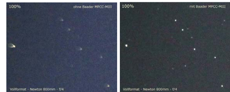
Picture detail at the edge to full frame format with and without Baader MPCC