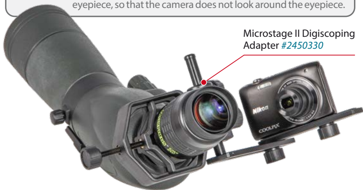
Microstage II Digiscoping Adapter #2450330

The large eye-lens of the Morpheus® eyepieces makes it possible to use also larger compact cameras – the camera's lens should be smaller than that of the eyepiece, so that the camera does not look around the eyepiece.