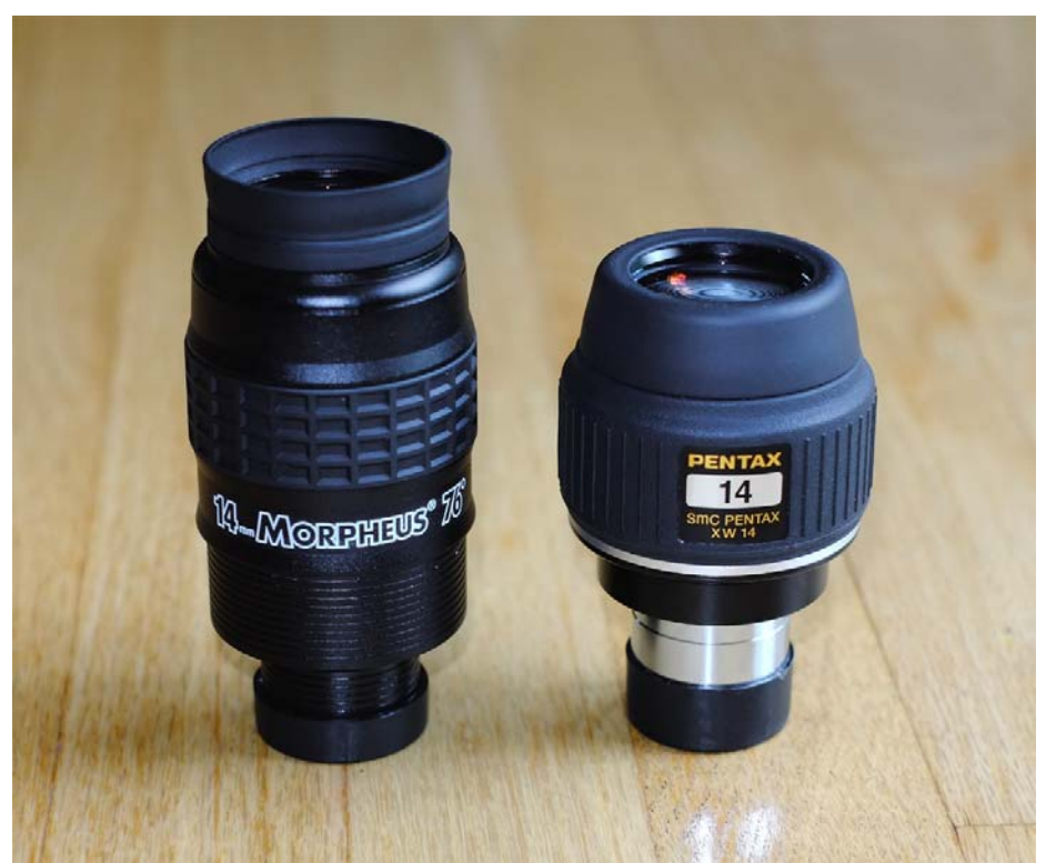
Fig 7: The Baader Morpheus form factor compared to the Pentax XW eyepiece.

Observational testing was conducted in a suburban location in Northern Virginia, west of Washington, D.C., where the light pollution level varies between light to moderate, depending on the particulates and water vapor in the atmosphere. Limiting magnitudes at this location vary on Moonless nights from magnitude 4 to magnitude 6. For this review the Morpheus eyepieces were tested in a wide variety of telescopes: