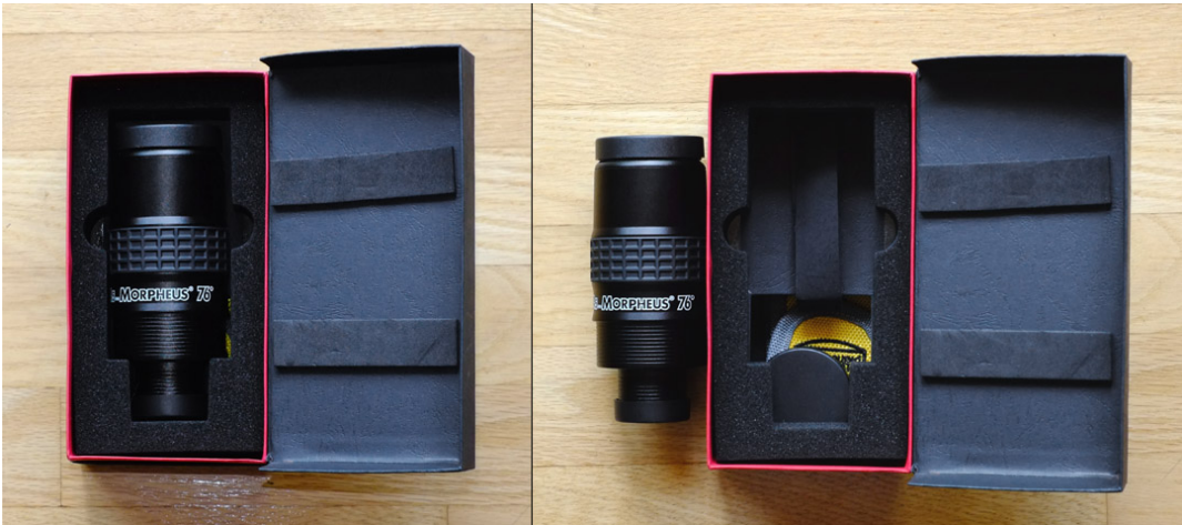
Fig 4: Morpheus eyepiece packaging.

compression rings or cause improper seating when in binoviewers. The safety-kerfs I found only very minimally provided any additional safety if I did not tighten the eyepiece in the focuser. As a plus though, I can say that they did not impede the user or function of the eyepiece in any way, and allowed precise seating of the eyepiece, unlike undercut designs.