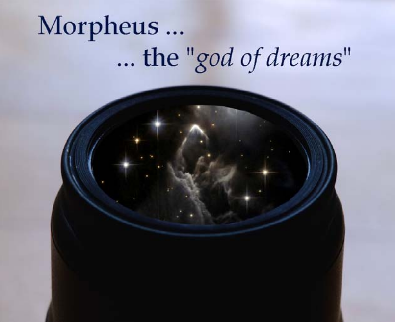
Fig 11: Image inset: Nebula IRAS 05437+2502

Morpheus, in Greek mythology known as the god of dreams, and now the new Baader Planetarium entry in the field of high-performance wide fields. In field tests, Morpheus eyepieces proved themselves to be a very sizable step up in both performance and ergonomics compared to the older Hyperion line. Its expansive 76° AFOV, friendly long eye relief, comfortable no-hassle eye positioning behavior, and most importantly its uncompromising excellent performance even in a fast f/4.7 Dobsonian, provided uncompromising views in a fast