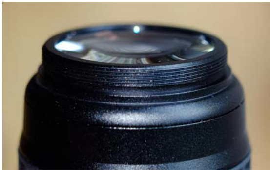
Fig 3: M43 photo-visual threads under the eyeguard.

Fig 2: Major build features of the Morpheus eyepiece. accessories and cameras to the top of the Morpheus eyepieces. The rubber hand grip appears well made and robust, and each eyepiece provides a stock number that indicates the focal length group (i.e., all Morpheus of the same focal length will show the same stock number). All the graphics are photo-luminescent (i.e., they glow in the dark). In the field I found that after sitting a short while they would lose their glow, so I typically just closed my eyes to retain my dark adaptation and briefly shone a light on the graphics to re-energize them if I forgot what focal length I was working with.