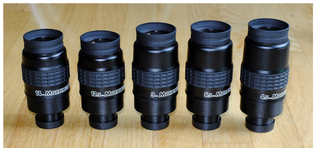
Fig 1: Baader's new Morpheus eyepieces -- precision optics, light weight, comfortable, engaging, and photo-visual ready.

The new Baader Morpheus eyepieces sport a wide 76° apparent field of view, comfortable eye relief, sealed watertight housings, and an optical design that provides sharp-to-the-edge performance even in fast focal ratio telescopes.