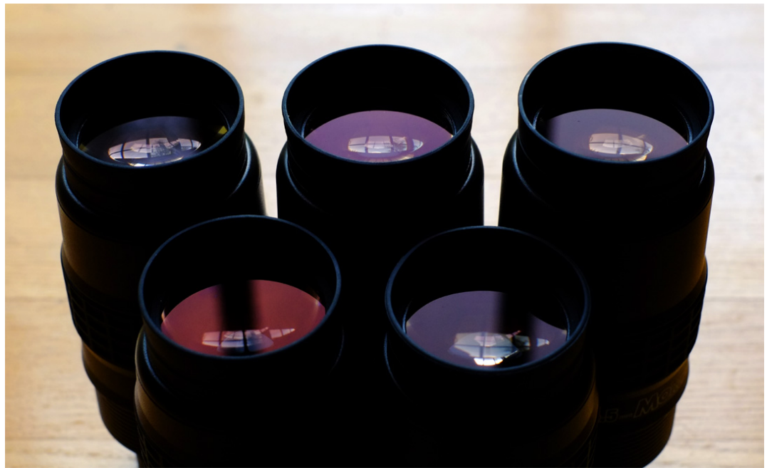
Fig 5: The Morpheus eye lenses from left to right; back row - 9mm, 6.5mm, 4.5mm; front row - 14mm, 12.5mm.

The packaging of the Morpheus is an attractive box with cutout foam to hold the eyepiece. The eyepiece comes wrapped in a protective plastic pouch with a silica desiccant dehumidifier packet to minimize moisture. Removing the foam inset provides access to the standard accessories that come with each Morpheus. These accessories include: a second top dust cap, and extra paper box band to prevent the box from opening, the optional winged eyeguard, and the Cordura holster that can attach to your waist belt for easy access (note - Cordura is the brand name for a collection of fabrics known for their durability and resistance to abrasions, tears, and scuffs).