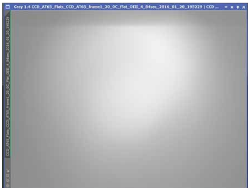
This image shows a horizontal line in the upper part – which was caused by the edge of the camera chip.

After the cause was found, the solution was easy: The filter was mounted with an additional 5mm spacer ring, so that the maxima of the reflection were suppressed, and the system worked as intended.