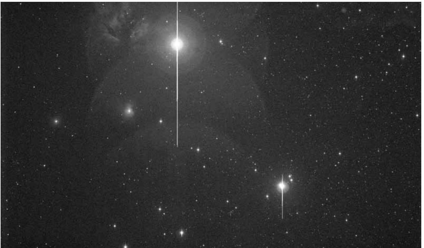
This image shows large reflections caused by a coma corrector as well as halos around bright stars.

You can find a detailed text about the cause finding of filter halos at https://web.archive.org/web/20140729003031/http://www.astrodon.com/articles_faq/articles_faq/press_release:391,355,49