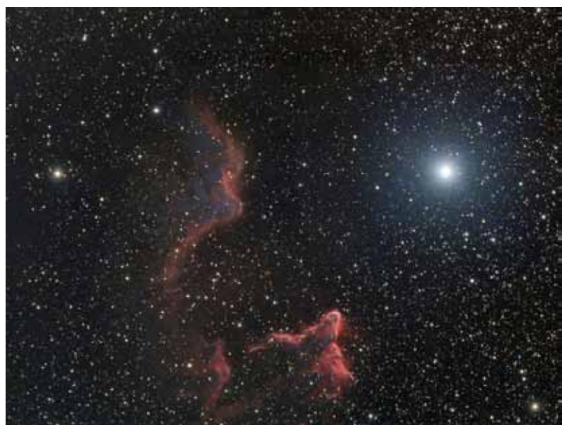
A halo which is caused by clouds in the atmosphere or dew on the optics.

Of course, also our atmosphere can cause beautiful halos. Light scattering at water drops in the air or at dirt on the lens has got the same effect as a softener in front of the lens. If a halo is very soft and without steps, it is very probably caused by this. Even faint cirrus clouds, which are hard to see for the naked eye at night, can have this effect. These halos will not appear in clear nights and with pristine optics – but they will cause confusion, if clouds are gathering in the night or the lens is moistened with dew.