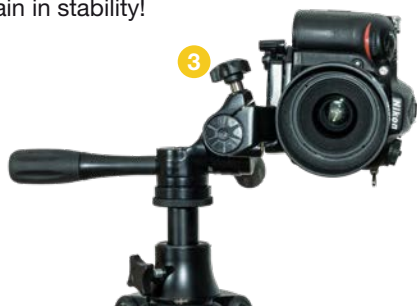
Above: A camera in portrait format for taking pictures in portrait format; right: A small telescope.

Even small telescopes with an adapter plate with a photo thread on the right hand side can be used so that the fine adjustment and finder are oriented correctly. Compared to some of the mounts supplied with entrylevel telescopes, this is a clear gain in stability!