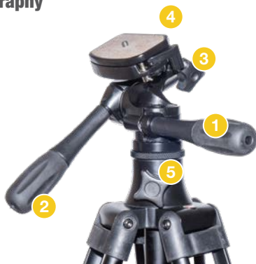
The fluid tilt head with quick release plate and the specially arranged handles.

However, the second handle gives you more comfort when panning. However, since there is no load on the panhead in this axis, you can replace it with the screw as a slip clutch when observing near the horizon. Depending on whether compact packing dimensions and quick usability or more comfort and accuracy during panning as well