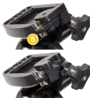
Der Scherungshebel der Schnellwechsellplatte. Oben verriegelt, darunter entriegelt.

If you often switch between several devices, working becomes really convenient if you use additional, optionally available quick-release plates (#2451021). Then the quick-release plate can remain on the device and you can, for example, take off one camera and put on a spotting scope in a few seconds – without any tedious screwing. To attach devices with ⅜ inch thread, you still need a reducer to ¼ inch thread (not included with the tripod, please contact the manufacturer of your device or your photo dealer).