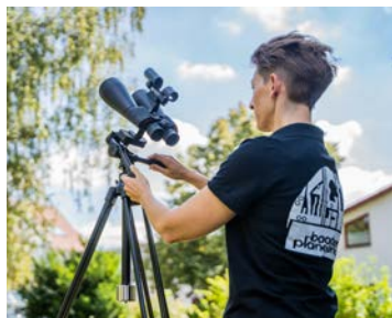
The special arrangement of the handles enables sensitive tilting – here a 70mm binocular with Baader SkySurfer III illuminated dot finder #2957300