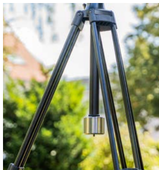
The optional 1 kg leveling counterweight #2951401 at the center column

You can still hang your backpack between the tripod legs by suspending it with small tension straps between the tripod legs – there is enough space below the braces. This way you can access your backpack without putting it on the ground. By the way: Even if you hang your backpack on a classic tripod with hooks on the centre column, you should also attach it to the tripod legs with tension straps to prevent it from swinging.