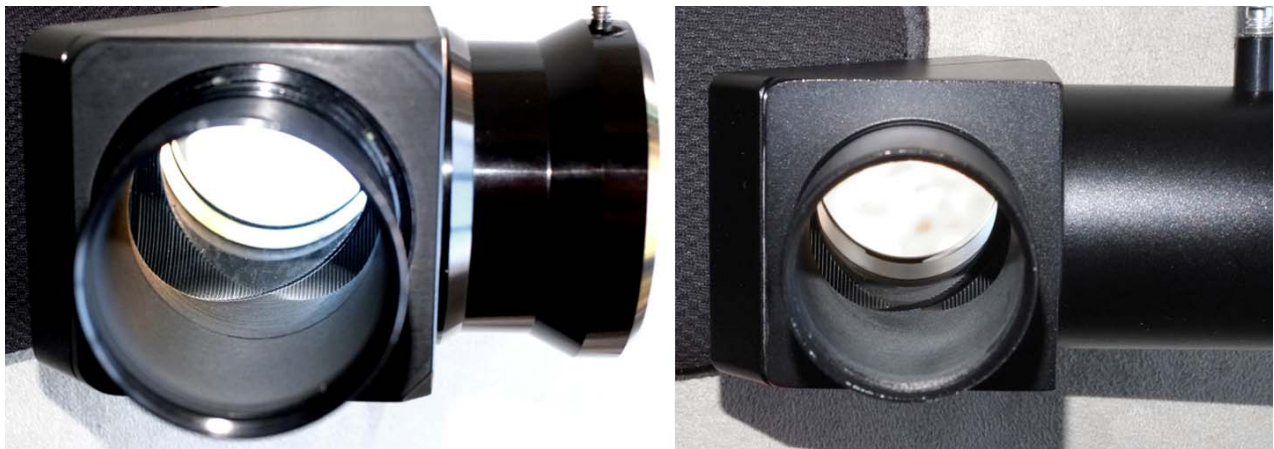
Figure 6 Micro-baffling in the Astro-Physics MaxBright (Left) and Tele Vue Everbrite (Right) Image by the Author; Diagonals courtesy of Daniel Mounsey & Steve Stapf

The internal baffling and blackening were also scrutinized on each diagonal, as lack of sufficient baffling can lead to reduced contrast views, flare, or a general brightening of the field of view, particularly when very bright targets like the Moon are viewed. As expected, the price class of the diagonal often aligned with how much attention was paid to internal light suppression. Figure 6 shows the diagonals which incorporated micro-baffles in addition to interior flat black paint.