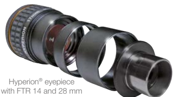
Hyperion® eyepiece with FTR 14 and 28 mm

Inside the blocks in the table marked with rectangles, the middle column of the first block states the original focal length of each eyepiece. The column of the second block is the focal length of the eye-piece with a 2" eyepiece filter mounted between the front part of the eyepiece and the main body. The third column of the second block gives the focal length of the individual eyepieces with the first group of lenses completely removed.