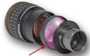
Use of a 2" filter

The first group of lenses is located inside the 1¼" nose piece. If this part of the eyepiece is removed, the rest of it can be used as a 2" eyepiece with a changed focal length. Similarly, if a 2" filter is inserted between the 2" and 1¼" barrels (as shown in the illustration above), another, different focal length results. The following table details the resulting focal lengths: