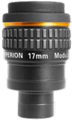
Hyperion® 17 mm eyepiece

The term "Multiple Focal Length (MFL)" in this brief description is put in quotation marks, because the modular design and the use of distance rings (finetuning rings) enables the user to vary the focal length for all Hyperion® eyepieces – except for the 24 mm Hyperion® eyepiece, which has only one fixed focal length.