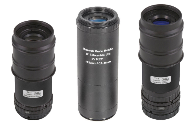
Telezentric System 2x, 3x and 4x

Because all the principal rays across the image plane are perpendicular to the image plane. The rays at the edge of the field will pass through an etalon just in front of the focal plane with exactly the same geometry as the rays on axis. So in a f/30 telecentric refractor the etalon sees the exact same 2.5 degree geometry clear across the field, and the spectral bandpass does not shift the wavelength across the field.