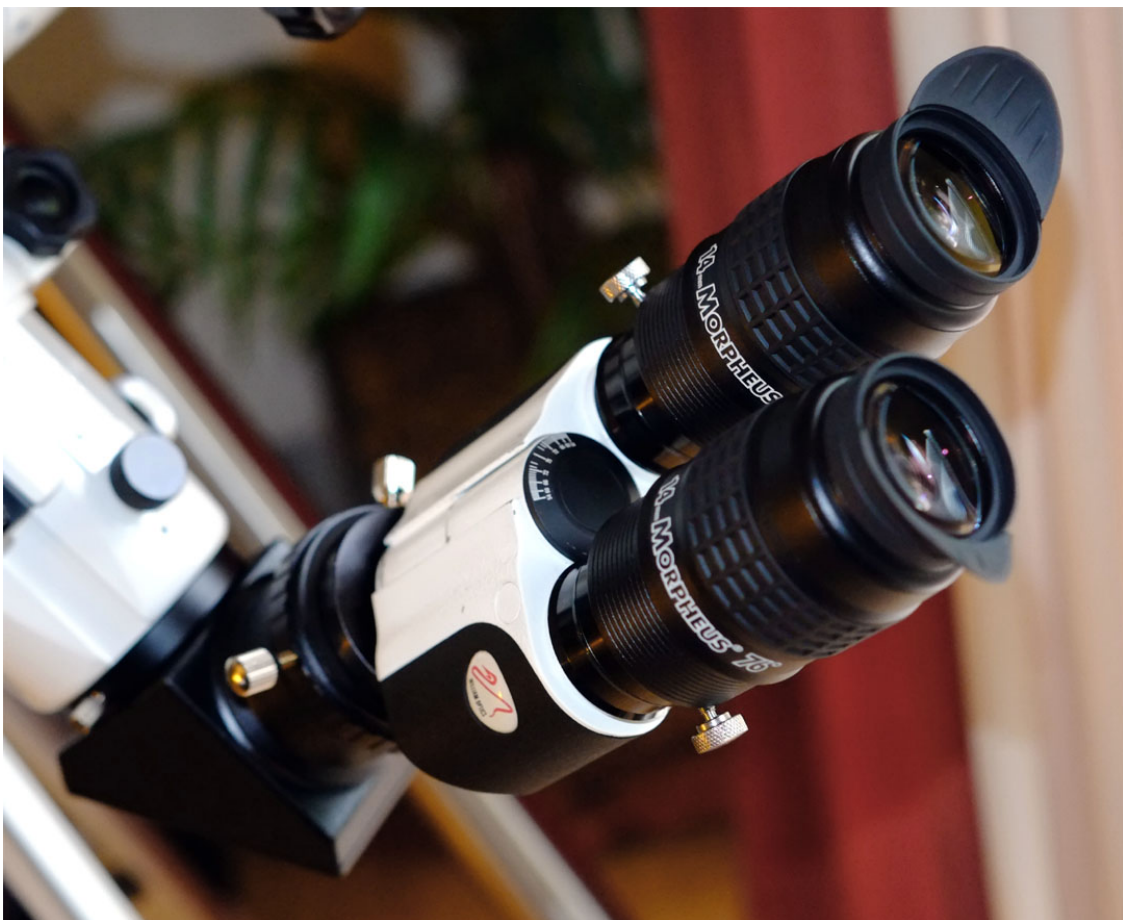
Fig 10: 14mm Morpheus eyepieces with included optional winged eyeguards in a William Optics binoviewer.