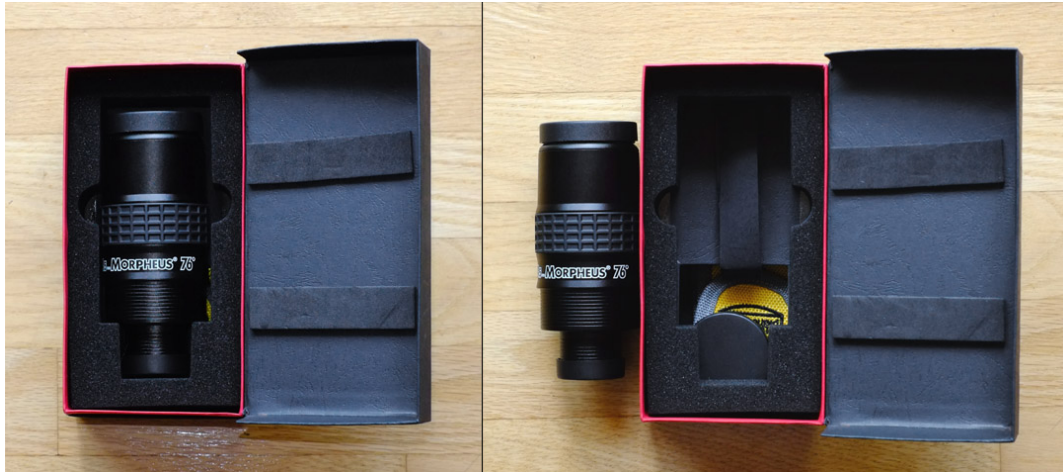
Fig 4: Morpheus eyepiece packaging.

compression rings or cause improper seating when in binoviewers. The safety-kerfs I found only very minimally provided any additional safety if I did not tighten the eyepiece in the focuser. As a plus though, I can say that they did not impede the user or function of the eyepiece in any way, and allowed precise seating of the eyepiece, unlike undercut designs.