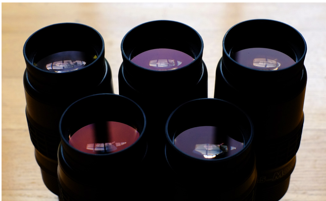
Fig 5: The Morpheus eye lenses from left to right; back row - 9mm, 6.5mm, 4.5mm; front row - 14mm, 12.5mm.

The packaging of the Morpheus is an attractive box with cutout foam to hold the eyepiece. The eyepiece comes wrapped in a protective plastic pouch with a silica desiccant dehumidifier packet to minimize moisture. Removing the foam inset provides access to the standard accessories that come with each Morpheus. These accessories include: a second top dust cap, and extra paper box band to prevent the box from opening, the optional winged eyeguard, and the Cordura holster that can attach to your waist belt for easy access (note - Cordura is the brand name for a collection of fabrics known for their durability and resistance to abrasions, tears, and scuffs).