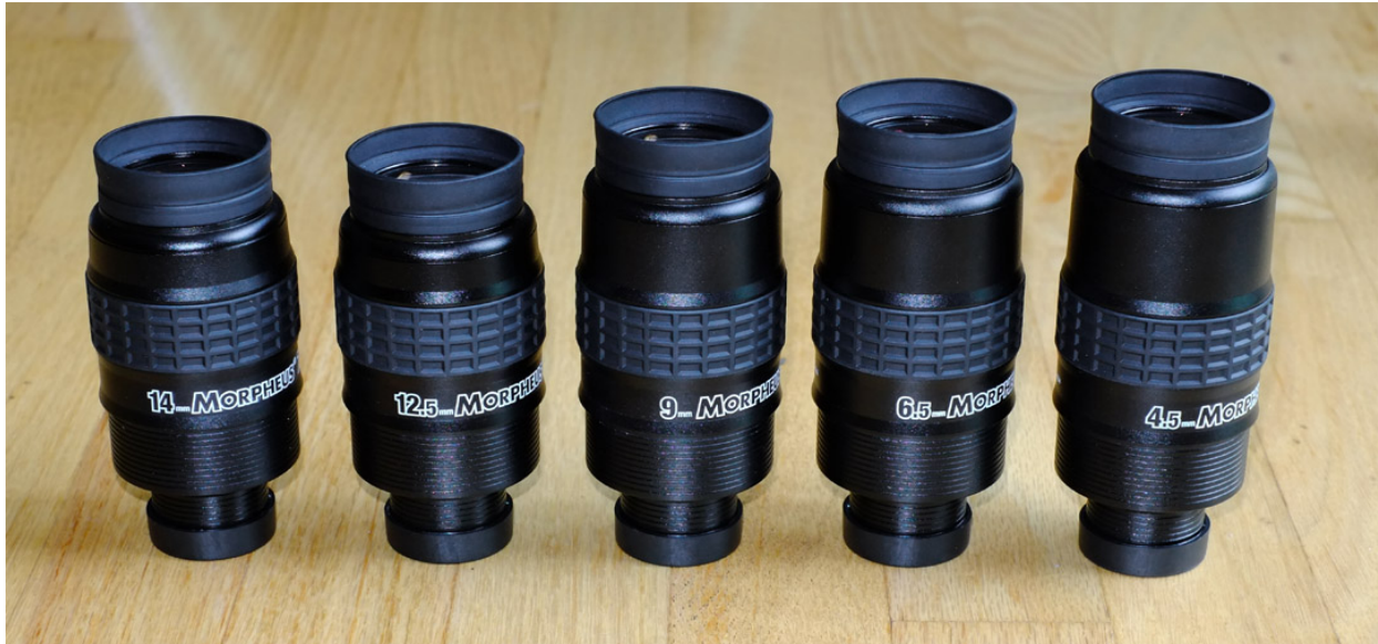
Fig 1: Baader's new Morpheus eyepieces -- precision optics, light weight, comfortable, engaging, and photo-visual ready.

The new Baader Morpheus eyepieces sport a wide 76° apparent field of view, comfortable eye relief, sealed watertight housings, and an optical design that provides sharp-to-the-edge performance even in fast focal ratio telescopes.