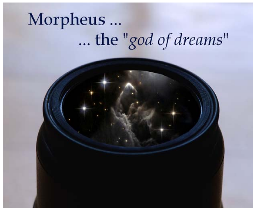
Fig 11: Image inset: Nebula IRAS 05437+2502

Morpheus, in Greek mythology known as the god of dreams, and now the new Baader Planetarium entry in the field of high-performance wide fields. In field tests, Morpheus eyepieces proved themselves to be a very sizable step up in both performance and ergonomics compared to the older Hyperion line. Its expansive 76° AFOV, friendly long eye relief, comfortable no-hassle eye positioning behavior, and most importantly its uncompromising excellent performance even in a fast f/4.7 Dobsonian, provided uncompromising views in a fast