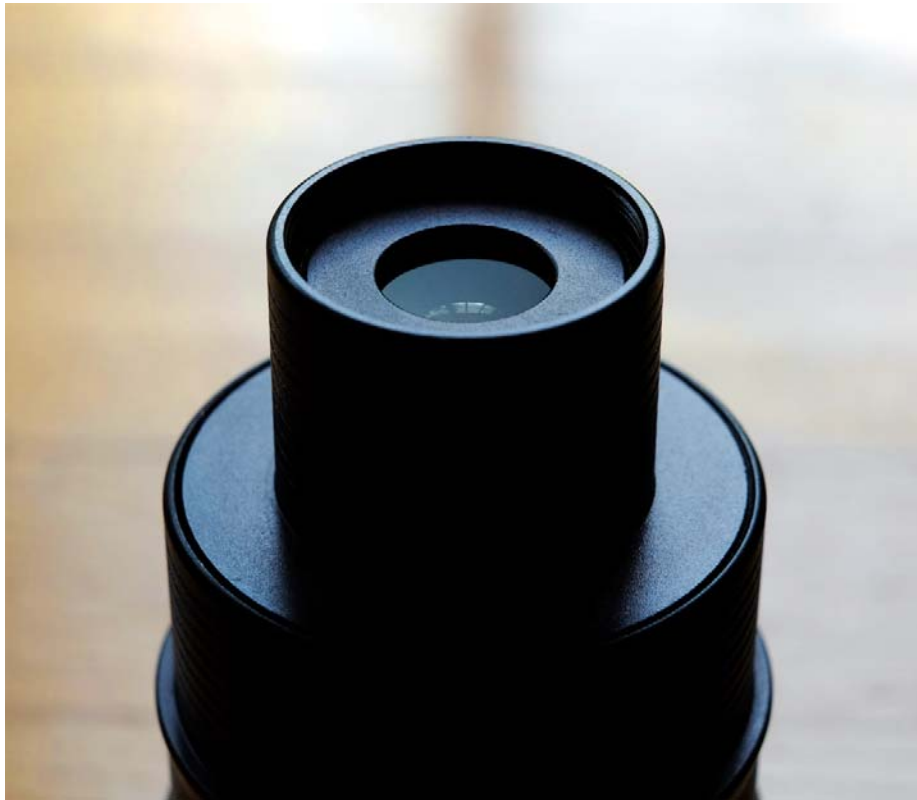
Fig 6: The 9mm Morpheus field lens.

For all Morpheus focal lengths the eye lenses are a large 37mm in diameter. Coatings are richly colored and the glass appears highly polished, typical of premium brands. The eye lenses are all flat and are inset less than 1mm from the top housing allowing almost all available optical eye relief fully accessible, in addition to allowing easy cleaning. I was very pleased to see the special attention to seating the top of the eye lens very close to the top housing. Too often manufacturers create designs with long eye relief only to waste this advantage by seating the eye lens too far into the eyepiece housing.