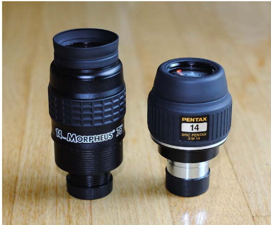
Fig 7: The Baader Morpheus form factor compared to the Pentax XW eyepiece.

Observational testing was conducted in a suburban location in Northern Virginia, west of Washington, D.C., where the light pollution level varies between light to moderate, depending on the particulates and water vapor in the atmosphere. Limiting magnitudes at this location vary on Moonless nights from magnitude 4 to magnitude 6. For this review the Morpheus eyepieces were tested in a wide variety of telescopes: