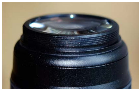
Fig 3: M43 photo-visual threads under the eyeguard.

visual threads, used to attach optional photo accessories and cameras to the top of the Morpheus eyepieces. The rubber hand grip appears well made and robust, and each eyepiece provides a stock number that indicates the focal length group (i.e., all Morpheus of the same focal length will show the same stock number). All the graphics are photo-luminescent (i.e., they glow in the dark). In the field I found that after sitting a short while they would lose their glow, so I typically just closed my eyes to retain my dark adaptation and briefly shone a light on the graphics to re-energize them if I forgot what focal length I was working with.