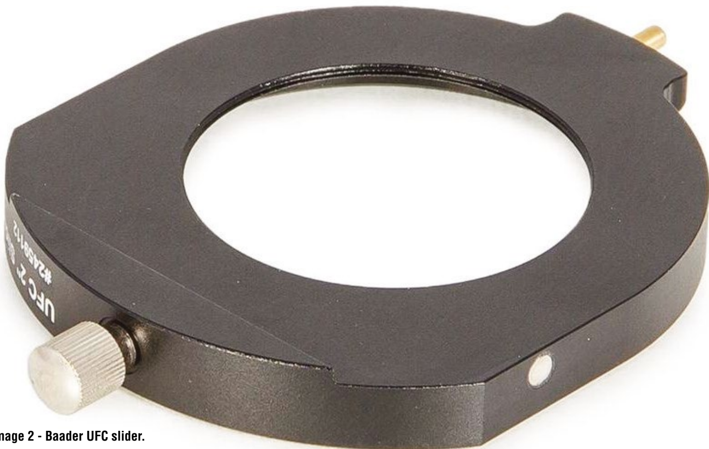
Image 2 - Baader UFC slider.