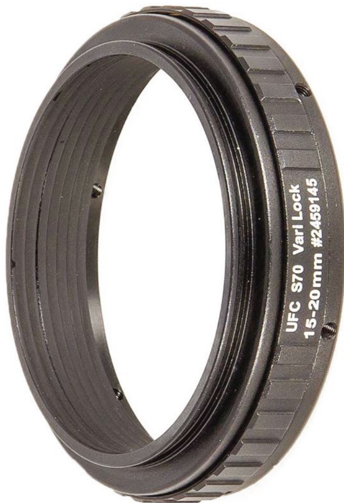
Image 5 - Baader UFC VariLock.