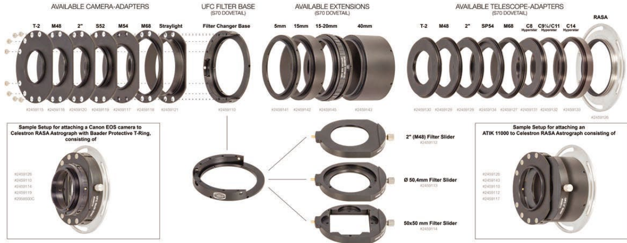
Image 4 - The complete line of Baader UFC accessories.

using on camera lenses. Oh, and there are connectors for FLI and Starlight Xpress cameras as well. Couple that with various extenders and spacers to get you to your backfocus, and, voila: you've got yourself a perfectly placed filter tray holding a variety of filter Sliders, and the whole kit and the caboodle can be taken off one scope and put on another.