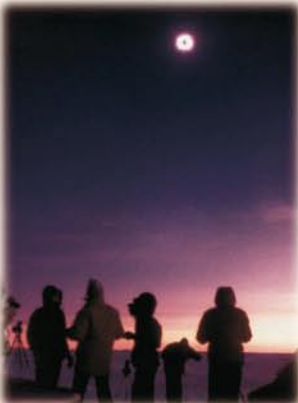
Scenery during eclipse totality