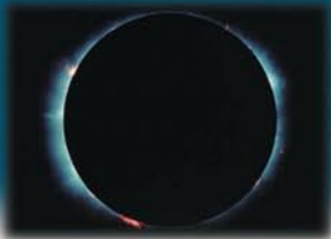
Total solar eclipse