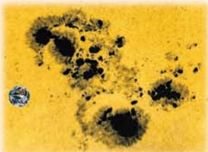
Sunsspots in comparison to Earth