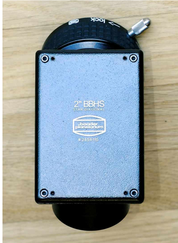
Fig 3: Bottom view.

From a weight perspective, all three diagonals had a similar heft. I did not have a precision scale to do exact weightings, but their feel was very close with the Zeiss prism perhaps being slightly heavier than the other two. Internally, the Baader BBHS diagonal uses flat black micro baffling for light suppression in the nose piece, with side walls in the interior housing smooth and flat blackened.