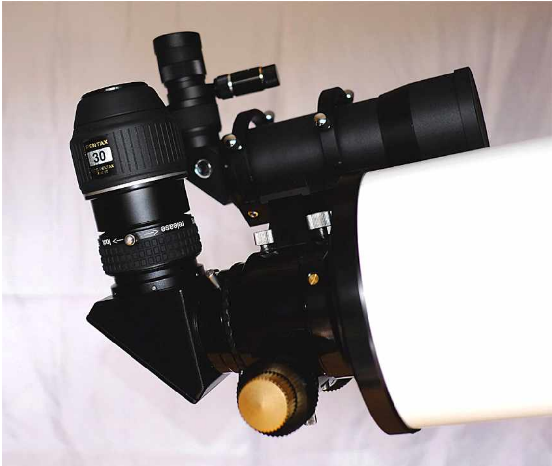
Fig 7: Baader BBHS diagonal on Lunt 152 ED-Apo with Pentax 30mm XW eyepiece.

Observational testing was conducted in a suburban location in Northern Virginia, west of Washington, D.C., where the light pollution level varies, depending on the particulates and water vapor in the atmosphere, between light to moderate. Limiting magnitudes at this location vary on Moonless nights from magnitude 4 to magnitude 5.5. For this review the diagonal was tested in three telescopes over the course of several months: