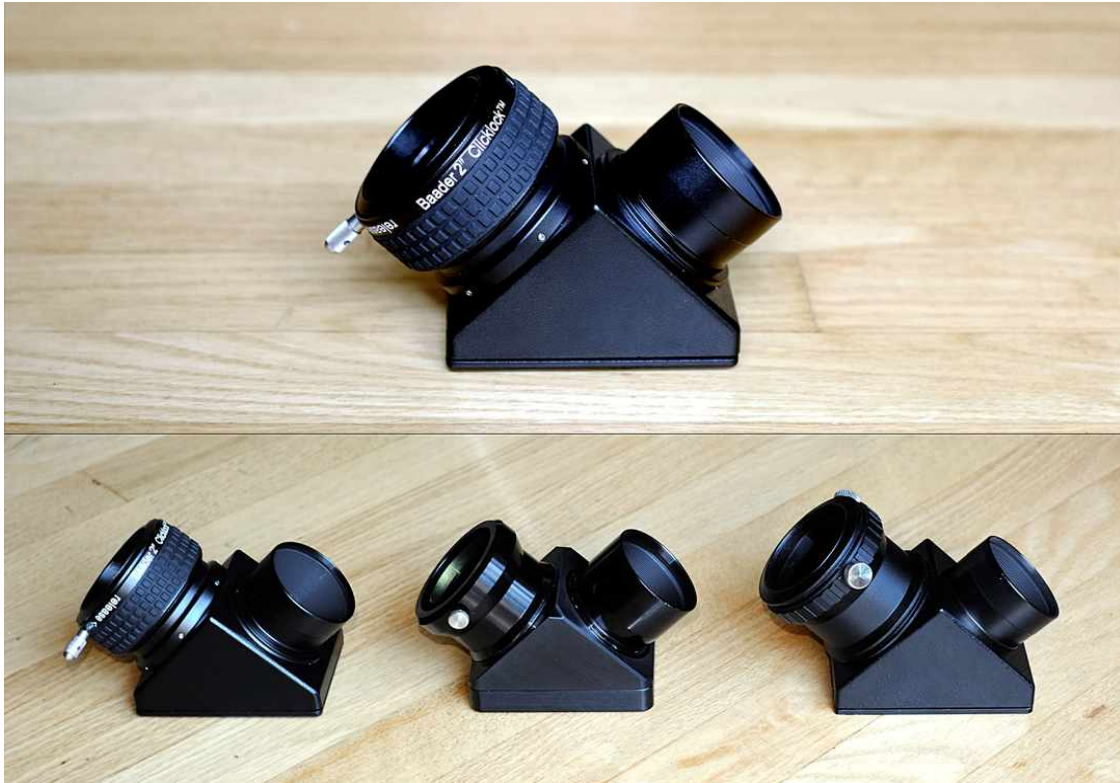
Fig 1: LEFT - Baader 2" BBHS Silver; CENTER - Astro-Physics 2" MaxBright Dielectric; RIGHT - Baader 2" Zeiss Prism.

by: William A. Paolini, February 13, 2016