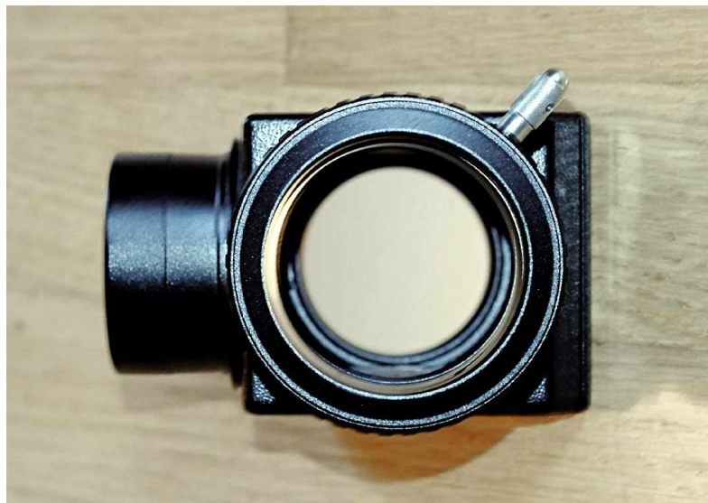
Fig 4: Top view of the Baader BBHS diagonal

From a weight perspective, all three diagonals had a similar heft. I did not have a precision scale to do exact weightings, but their feel was very close with the Zeiss prism perhaps being slightly heavier than the other two. Internally, the Baader BBHS diagonal uses flat black micro baffling for light suppression in the nose piece, with side walls in the interior housing smooth and flat blackened.