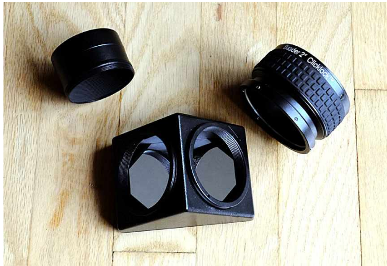
Fig 5: Disassembled for cleaning.

The BBHS diagonal I used for this test was not their T-2 version, but what they call the BBHS-Sitall Zenith Mirror diagonal (Baader product # 2456115). It comes standard with the 2" Clicklock mechanism at the eyepiece end and a 2" nosepiece for the focuser. While the nosepiece unscrews and uses threading like their other T-2 diagonals, the 2" Clicklock adapter does not attach using T-2 threads but is held in place by six small hex key set screws that secure themselves to a non-threaded housing.